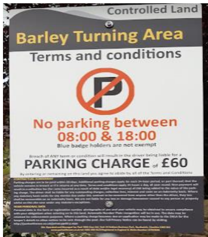
P1: Image of Signage on Car Park