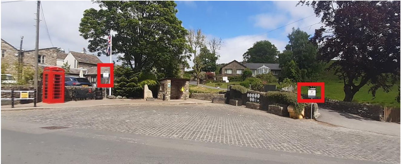
Photograph 1: Barley Turning Area with Parking Hours Restriction Sign

The turning area is a cobbled area in the centre of the village, with well-established flowerbeds, benches, a bus stop and shelter, war memorial, award plaques and a classic red phone box. This area provides a focal point within the village. It includes a right of way for the residents of Barley House Farm. The turning area is private land owned by Barley Parish Council – Land Registry LAN 94253 2016